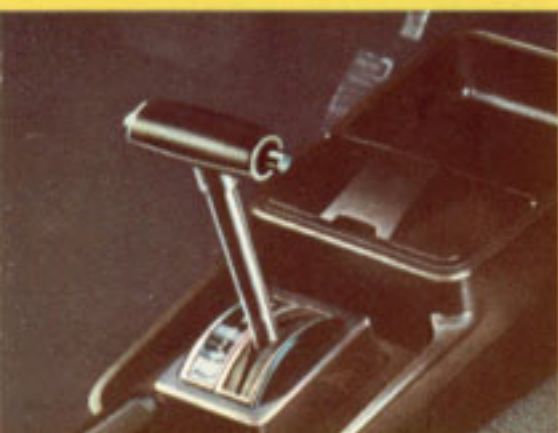
With the 99 HP car you also have the option of the Ford automatic transmission.

L trim: Chromium-plated mouldings. Heated rear window. Fully reclining seats. Carpeted floor. Map pockets. Clock. Trip counter. Glove compartment illumination.